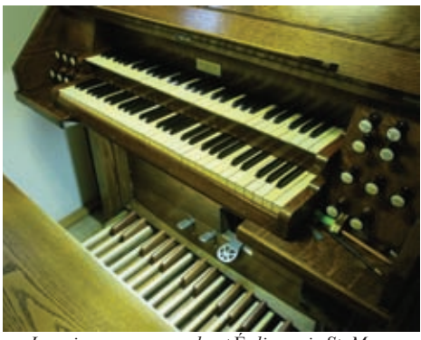
Lye pipe organ console at Église unie St. Marc

Two stops were added to the Great: a 2' Fifteenth mounted on a small windchest